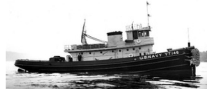
U.S. Navy Harbor Tug YT146 USS Hoga

Talk about getting a return on taxpayer money! Not many things can compare to the Navy Tug USS Hoga.